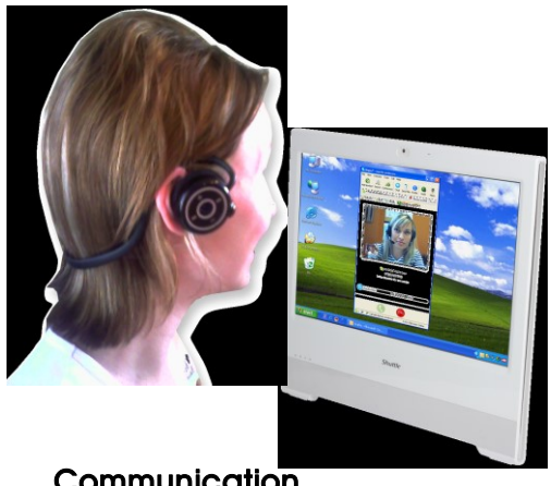
Communication Email, VoIP, Messenger, Blog, Video Conferencing