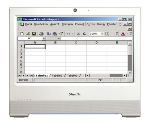
Office Work Word and spreadsheet processing, email, internet