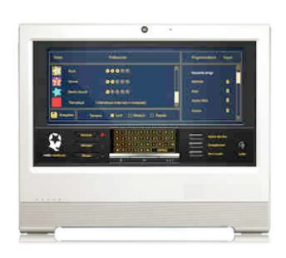
Instore Radio Playing advertising and music