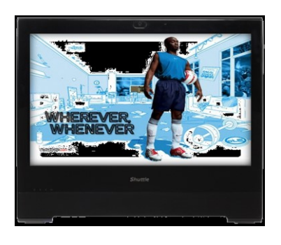
Digital Signage Visual advertising, entertainment, displaying information in public areas