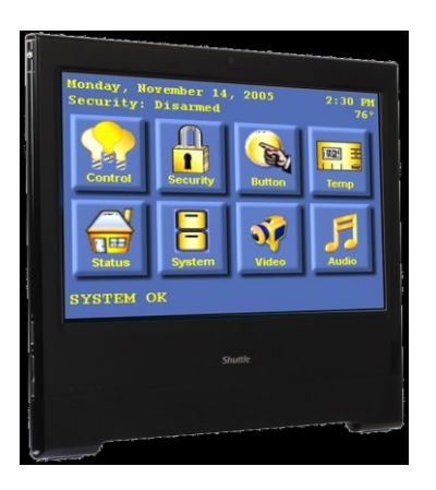
Control Surveillance, Home Automation, Control device