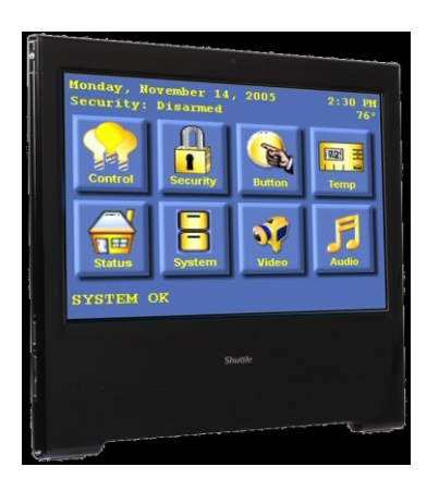
Control Surveillance, Home Automation, Control device