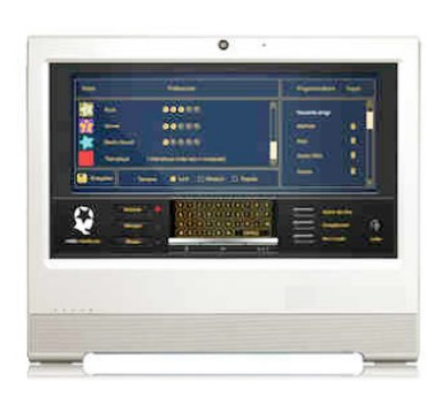
Instore Radio Playing advertising and music