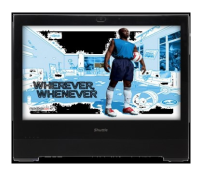
Digital Signage Visual advertising, entertainment, displaying information in public areas