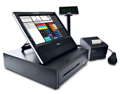
P.O.S. Point of sales