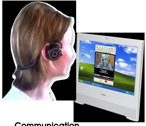
Communication Email, VoIP, Messenger, Blog, Video Conferencing