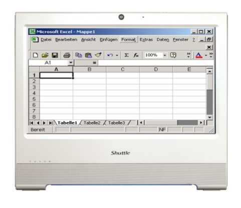
Office Work Word and spreadsheet processing, email, internet