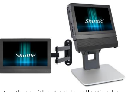
⇒ with or without cable collection box