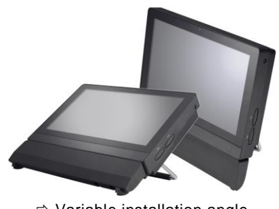
⇒ Variable installation angle