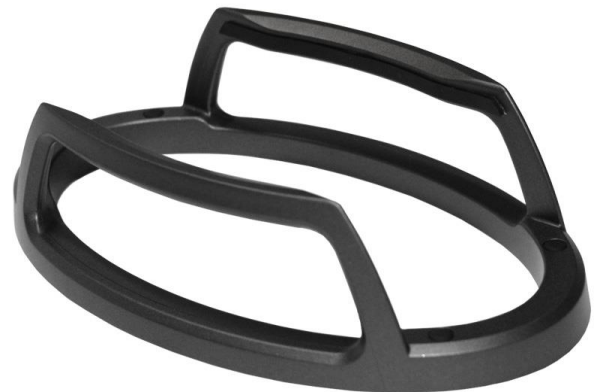
Vertical Stand PS01