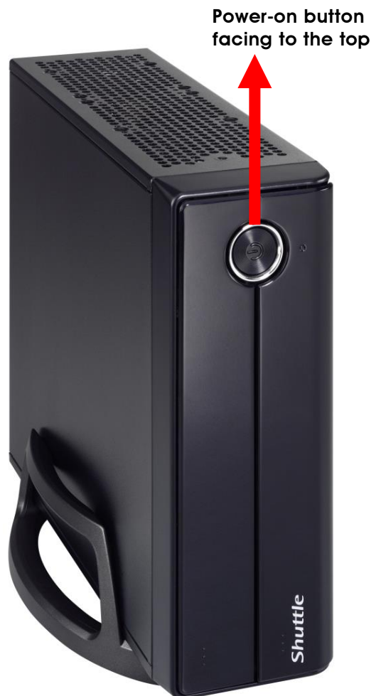
Shuttle 3L Slim-PC with PS01