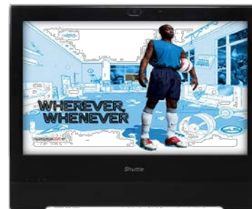
Digital Signage Visual advertising, entertainment, displaying information in public areas

© 2015 by Shuttle Computer Handels GmbH (Germany). All information subject to change without notice. Pictures for illustration purposes only.