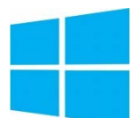
Windows 10 64 Bit