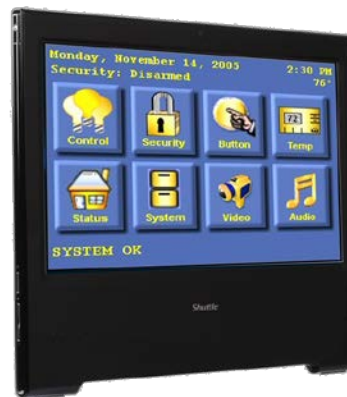
Control Surveillance, Home Automation, Control device