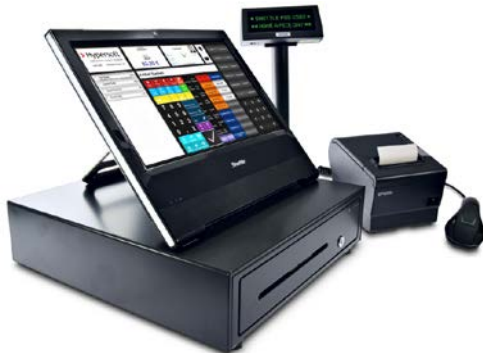
P.O.S. Point of sales