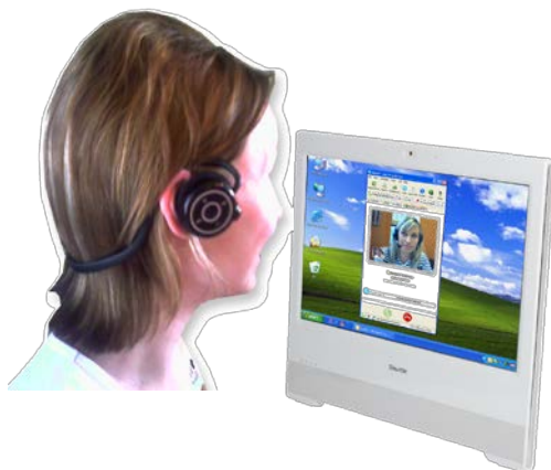
Communication Email, VoIP, Messenger, Blog, Video Conferencing