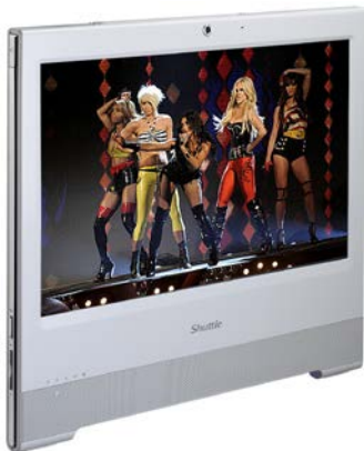
Entertainment Music, Movies, Photo gallery, TV* *) TV tuner USB stick required