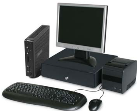
Point of sales with Shuttle XS 3601B