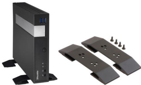
Stand for vertical operation (PS02)