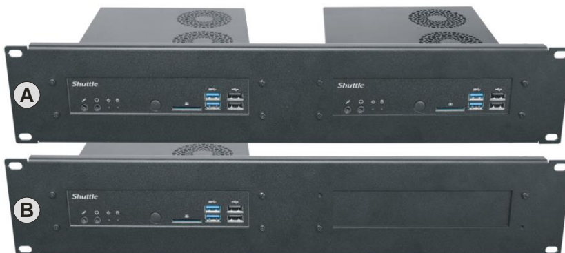
A) Two mounted PCs B) One mounted PC and additional cover plate