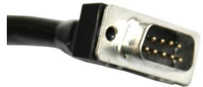
9-pin D-Sub connector