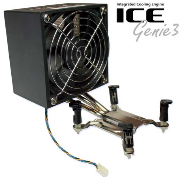
ICE Genie3 Heatpipe Module (PM65)