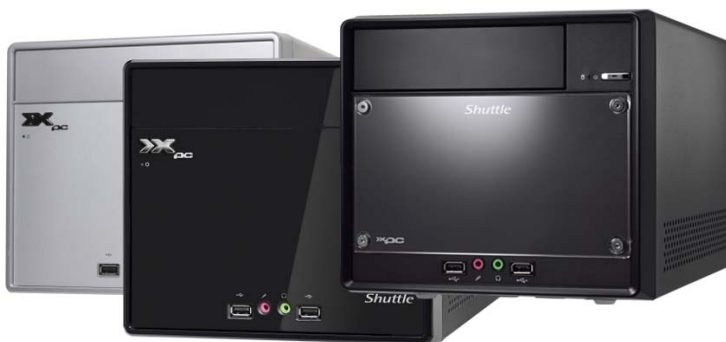
Shuttle XPC Barebone SG41J1 (silver and black) and SG41J4