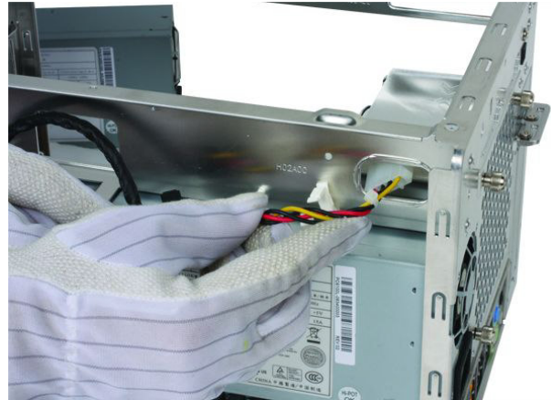
② Feed the HDD cable through the reverse hole as shown and attach to storage devices.