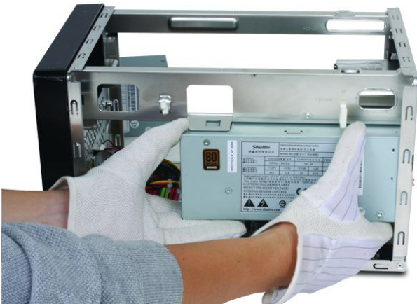
① Place the power supply in position. Secure from the back with three Phillips head screws.