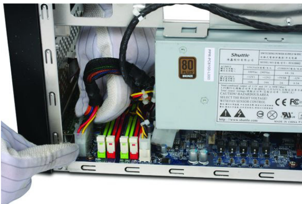
③ Attach the 20-pin ATX and 2x2-pin (or 1x4-pin) power supply plugs to the mainboard.