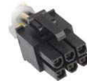
6 pin PCIe X16