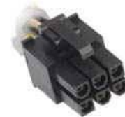
6 pin PCIe X16