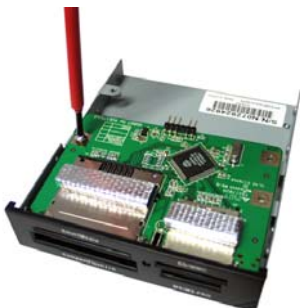
7 Tighten the screws of the circuit board