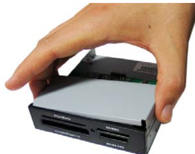
8 Replace the cover