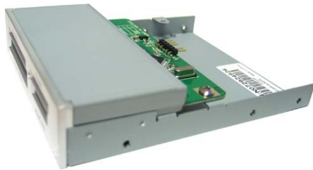
1 Place the drive on a desk