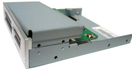
2 Remove its cover without tools