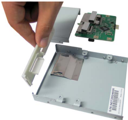
5 Remove the front panel upwards