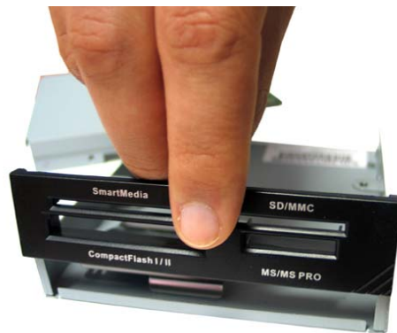
6 Put in the other front panel