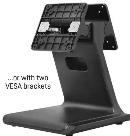
...or with two VESA brackets