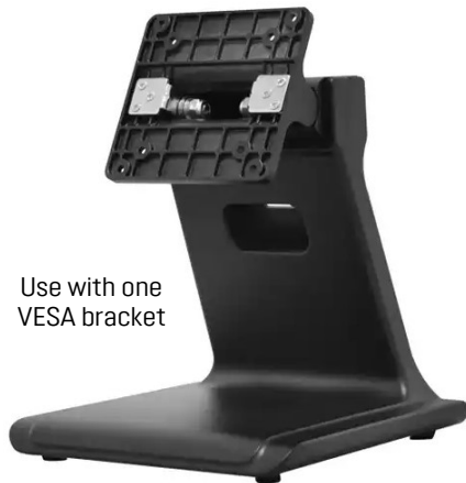
Use with one VESA bracket

The Shuttle POV21 is a robust Dual VESA stand in black for one or two screens up to 21.5". The sturdy construction made of high-quality aluminium alloy carries loads of up to 20 kg without bending. It features universal pitch angle adjustment and an internal cable slot which makes for a clean, tidy appearance on the desk. Installation is simple: first the VESA brackets are screwed to the display and then snapped and secured onto the stand. This high-quality stand is ideal for POS systems (consisting of AIO PC and customer display) or for Panel-PCs in industrial environments.