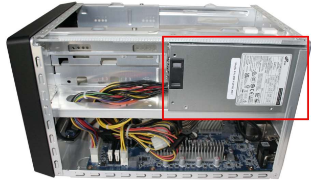
Use of the power supply FSP300 in the Shuttle XPC cube SH610R4